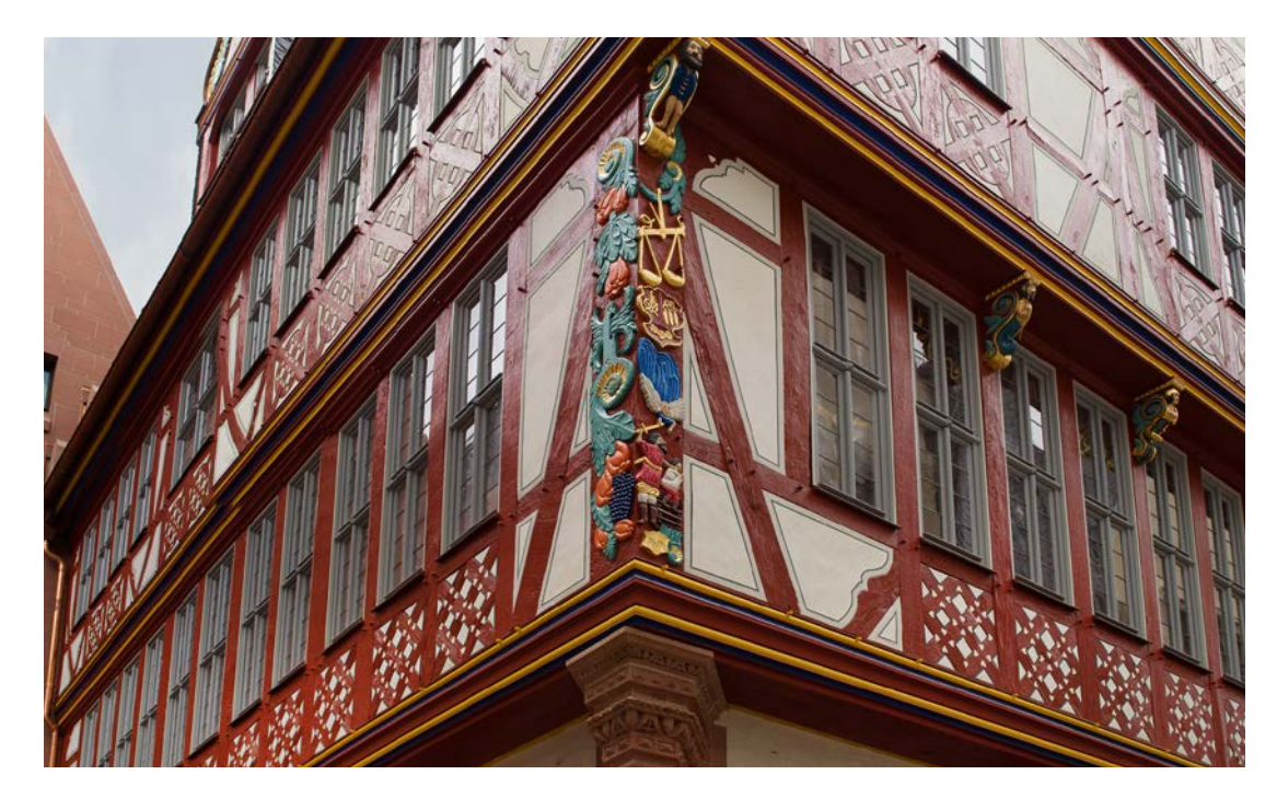
"Goldene Waage" building, Frankfurt am Main, Germany

SCHOTT's Glasses for Restoration are the best choice for the faithful restoration of historical buildings from various eras – mimicking the appearance of the original glazing materials – GOETHEGLAS for buildings from the 18th and 19th centuries, RESTOVER® glass for buildings dating from the early 1900s and TIKANA® glass for buildings from the classical modern period – these glasses also meet any number of contemporary needs because of the wide variety of processing options available, from UV protection to thermal insulation.