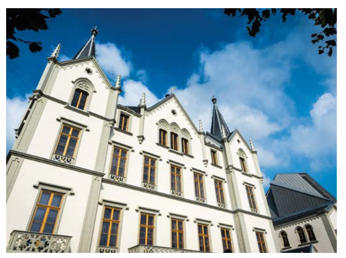
Château de l'Aile, Vevey, Switzerland

GOETHEGLAS is a colorless, drawn glass with the irregular surface characteristic of window glass common to the 18th and 19th centuries. It can also be used to protect precious, leaded glazing from the elements and other adverse environmental conditions.