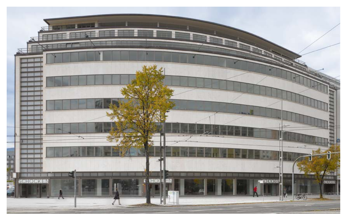
Schocken department store, Chemnitz, Germany