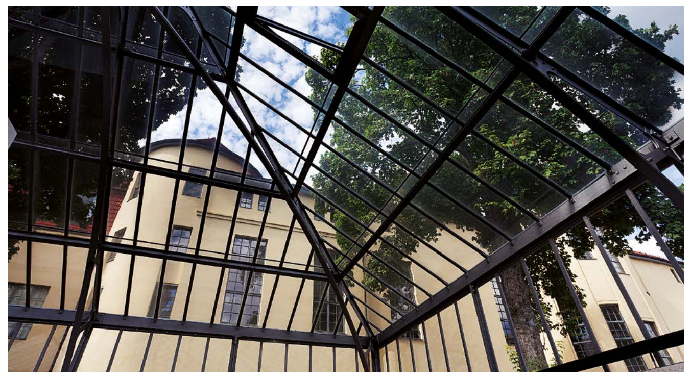
Bauhaus-University Weimar - The Brendel Studio using SCHOTT RESTOVER® laminated glass