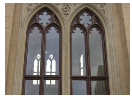
Babelsberg Palace, Babelsberg, Germany